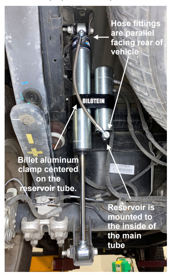
Hose fittings are parallel facing rear of vehicle BIL97-IIN Billet aluminum clamp centered on the reservoir tube. Reservoir is mounted to the inside of the main tube